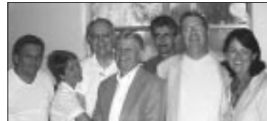
Affirming Clergy Breakfast Meeting

Our next Communication Course for people in ministry will take place on October 26 from 9:30 a.m. to 3:30 p.m. Please call 305-663-7195 to register for this course.