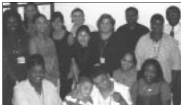
Agape Family Ministries Workshop participants

Project YES presented an in-service workshop for Agape Family Ministries. Agape works with women in the justice system who are in need of rehabilitation and family support services. Reflecting many varied points of view and a wide range of experiences on our issue, the entire staff was respectful and supportive in working for the safety of all youth.