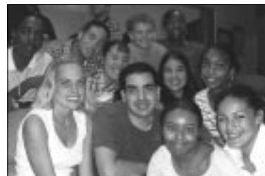
St. Bartholomew's Youth Group