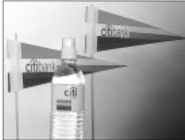
Citibank brought gifts to our community meeting

Some of this support includes services such as no-cost financial education seminars (in English and Español), including financial needs analysis "CitiPro", buying a home, women and investment, and debt management. These seminars are an opportunity to help our youth and community gather invaluable financial skills and resources. Through Citibank Florida, Project YES applied for a grant to fund our community leadership forum that will work for safer environments for gay and lesbian youth.