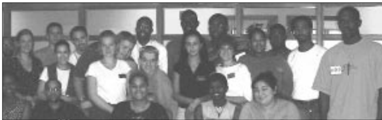
The Resident Advisors and Staff at Johnson & Wales University