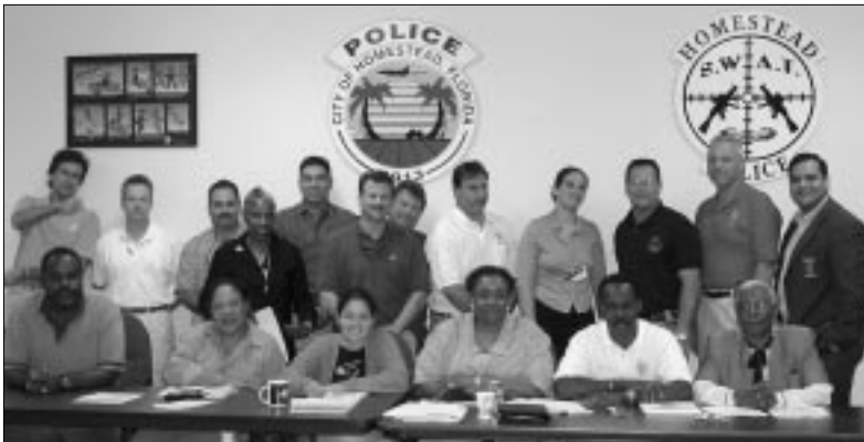
Homestead and South Miami Police Officers - First turns