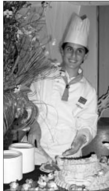
Johnson & Wales culinary student