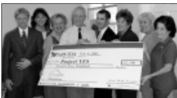
Arvida Realty presenting Project YES with an award