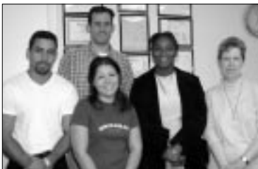
The Counselors at Regis House

I observed my first Project YES presentation at The Starting Place in Broward, a jail-like rehabilitation facility for youth in the Juvenile Justice System. I didn’t know what to expect...very much a “hope for the best, prepare for the worst” situation. The reception area had security glass and the elevator was key operated. Not exactly comfy.