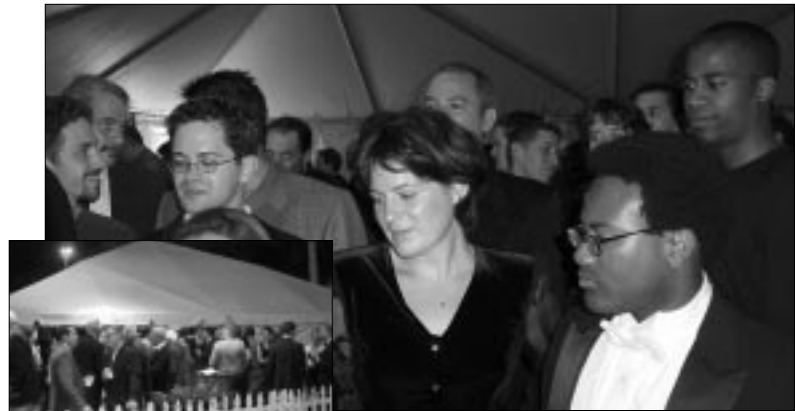
The reception following the concert