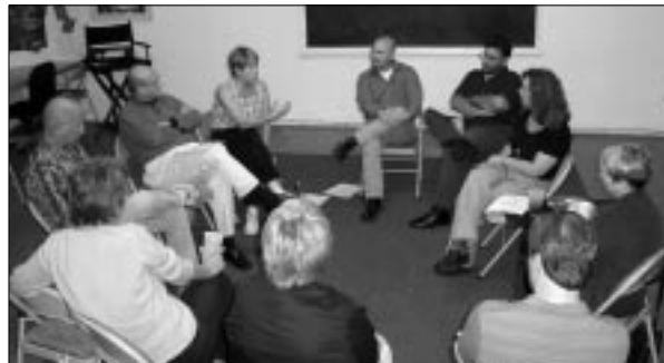
Community Care Orientation Meeting

Last week we held the first introductory meeting to share with interested people the steps involved in becoming Community Care Caregivers. The stories, motivations, and commitment displayed were inspiring. We hope to soon schedule the first training classes for interested caregivers.