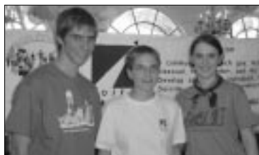
Project YES participated at Coral Gables Congregational Ministry Fair and shared our work with new members in the local faith community.

If you would like more information on how you can contribute to making sure the work of Project YES continues, please call us at 305-663-7195 .