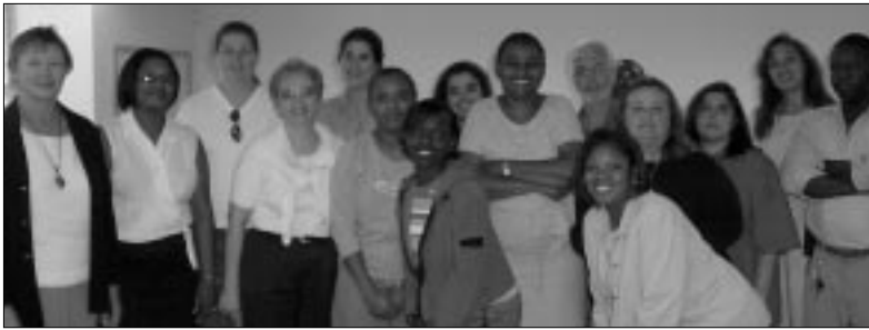
Counseling Special and Diverse Populations Class at STU.