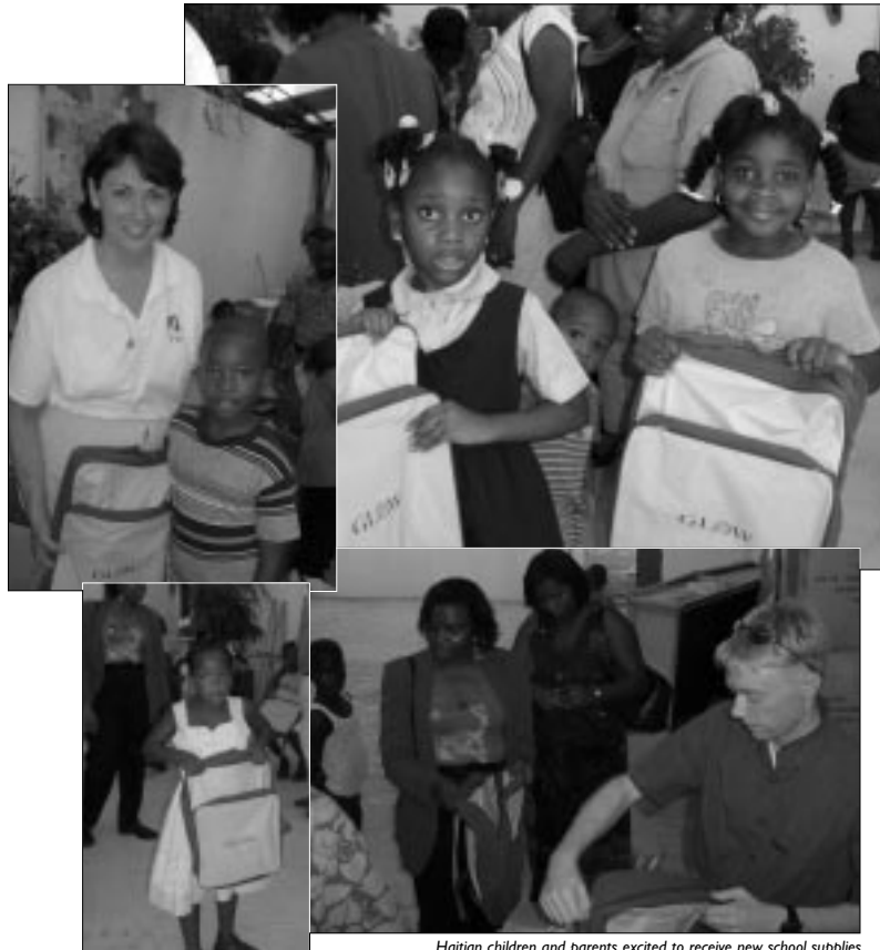
Haitian children and parents excited to receive new school supplies

Thirty PTA leaders engaged in a very spirited discussion on the issue of sexual orientation. The realization of how difficult this topic is for parents was truly sobering. Even parents who have gay or lesbian youth preceded their comments with a cover statement about moral and religious positions. Several PTA members suggested the best way to include the issue was to categorize it under the broad heading of "harassment" and not mention the words "gay" or "lesbian." Religious conflicts and the judgments of others combine to keep parental concerns silent. We hope this workshop will help PTA leaders step forward and open dialogue in local PTA units across our state.