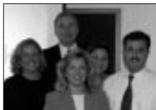
Citibank mortgage and banking professionals led the workshop

One of the great hallmarks of the American Dream is the opportunity to own your own home. Yet in a society of primarily heterosexual