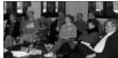
Training at Hanover Presbyterian Church