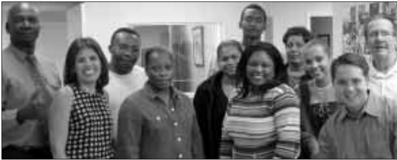
Department of Children & Families staff