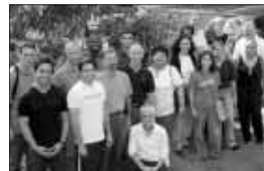
Communication Course participants

We are always delighted by the diversity of participants in our Communication Course. Representatives from United Way, The Village, Dade Community Foundation, Miami Beach Community Health Center, and SAVE Dade were among those who joined us for a fun and challenging weekend.