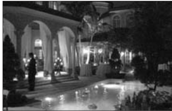
Poolside at the "Casino."