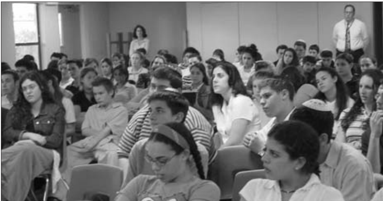
Students, faculty and clergy at Ben Lipson Hillel.