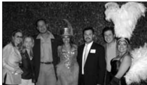
Citibank friends and supporters.