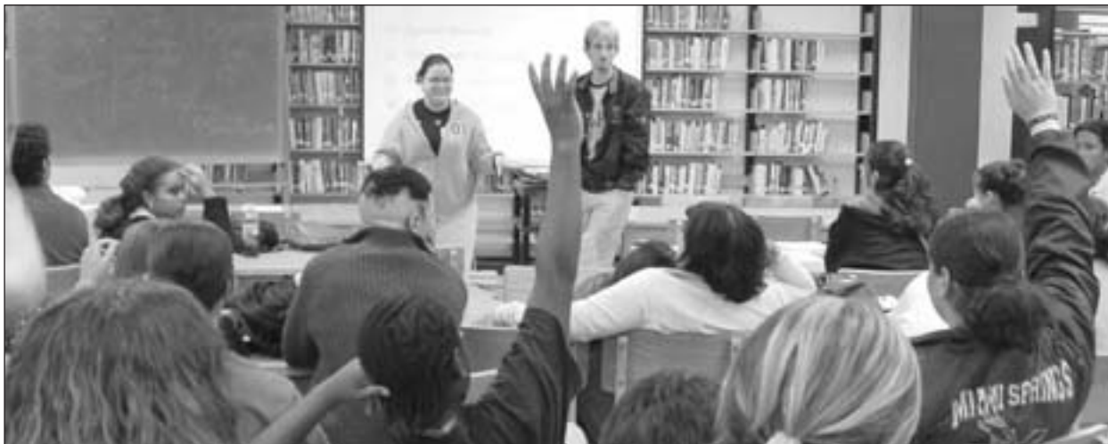
Students speaking out at Miami Springs High School.

School counselors rate the SAFE-T Course as one of the most effective tools for students to listen and dialogue about problems in schools, from homosexuality to cheating, racism, and personal conflicts.