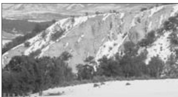
Project YES heads for the mountains of Colorado.

Harassment related to gender and orientation has become more virulent in schools as societal changes make these issues more topical and divisive. The repeated link to violence and bullying has become obvious to even the most conservative and fearful educators. They want desperately to respond in appropriate ways to mitigate the damage they see happening in schools every day. When they find out there is help available that can include all points of view and won't become divisive, they seek assistance. As a principal in an inner city Miami-Dade school recently said after one of our presentations, "What took you so long to get here?"