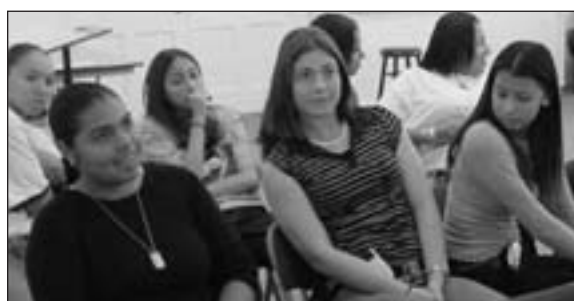
Girls engaged in communication exercises as part of the Women's Fund Initiative.