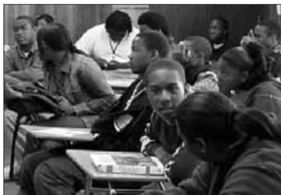
Over 300 students participated.