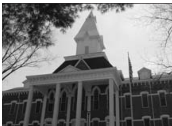
North Georgia College and State University.

Out of an urgent need for education on gender and orientation, new partnerships and requests for workshops are pouring into Project YES. Our courses were recently accredited in Colorado by the Roaring Fork District school system, and in Georgia by the School of Education at North Georgia College and State University (NGCSU). We will also begin working with the West Palm Beach school system, as well as continuing our efforts in Miami-Dade and Broward schools next year.