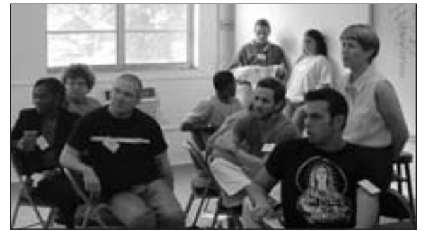
Course participants in discussion.

Each Communication Course gives us the opportunity to meet and work with amazing people using the power of their own voice to make a difference. Many effective actions quickly followed this course.