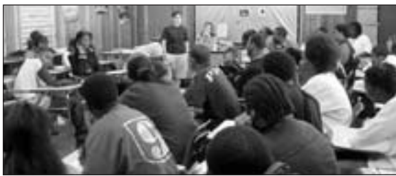
Students engage in discussion.

“Today I learned that gay people are human beings just like us. Just because they are gay doesn't give us the right to mistreat them.”