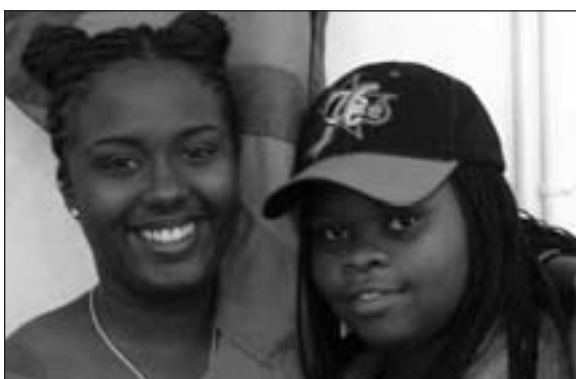
American High School students.

I want to thank Project YES so much for the SAFE-T course you did for my girls in April. They were so excited about their new ideas on communicating with others, especially on the topic of sexual orientation. One of the girls came to see me on Monday morning with stars dancing in her eyes – as a result of what she had learned on Friday and the confidence she