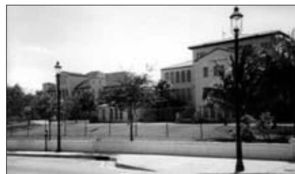
Alexander Dreyfoos School, West Palm Beach.