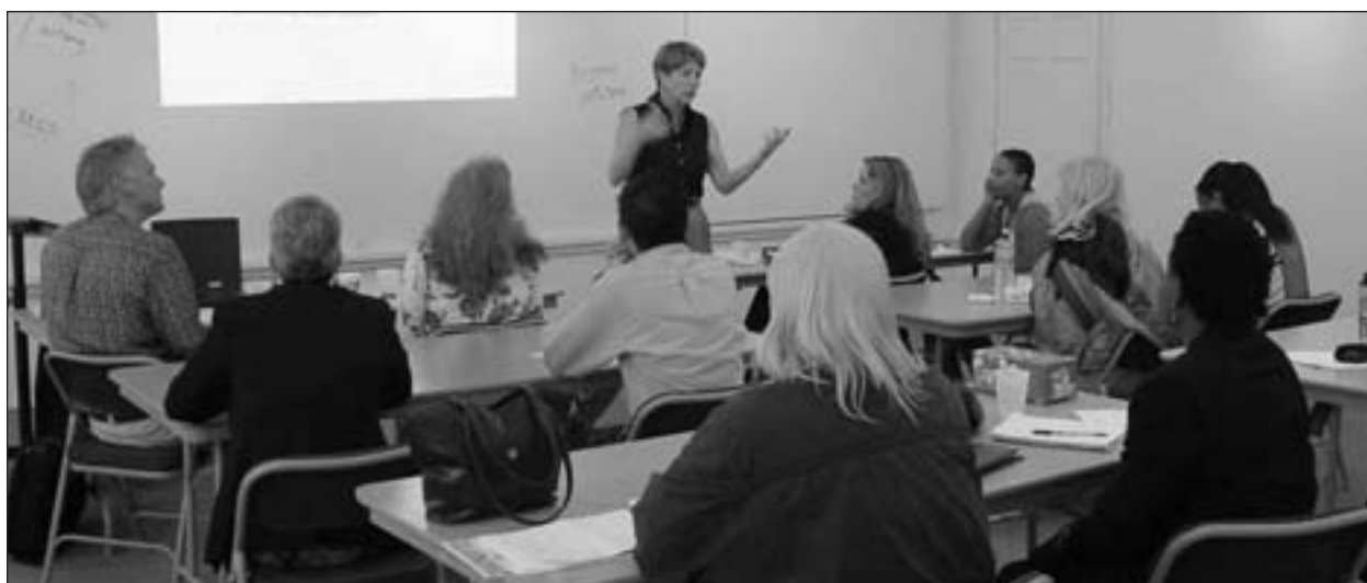
Learning about gender.

Out of an urgent need for education on gender and orientation, new partnerships and requests for workshops are pouring into Project YES. Our courses were recently accredited in Colorado by the Roaring Fork District school system, and in Georgia by the School of Education at North Georgia College and State University (NGCSU). We will also begin working with the West Palm Beach school system, as well as continuing our efforts in Miami-Dade and Broward schools next year.