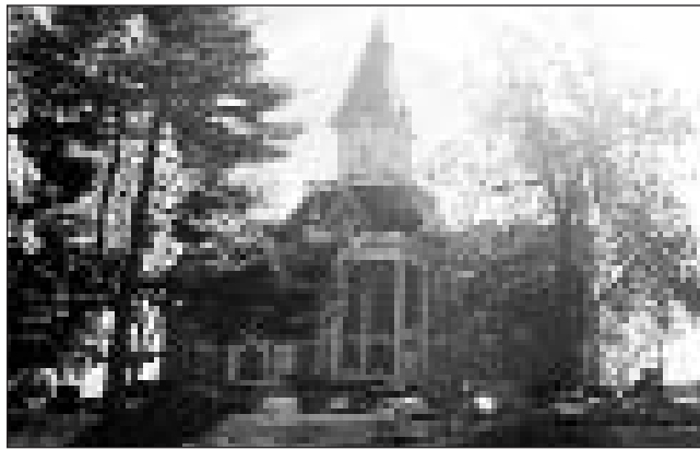
Price Memorial Hall NGCSU Campus.

The Dahlonega Ministerial Association (DMA) and North Georgia College & State University (NGCSU) have envisioned a partnership to bring together religious leaders, professional educators and community partners