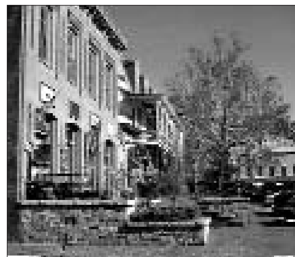
On the town square in Dahlonega, GA.

How to best respond to these and other challenges of a rapidly changing culture will be part of the course. This innovative partnership was proposed by the DMA and NGCSU School of Education making it a particularly powerful model for workability.