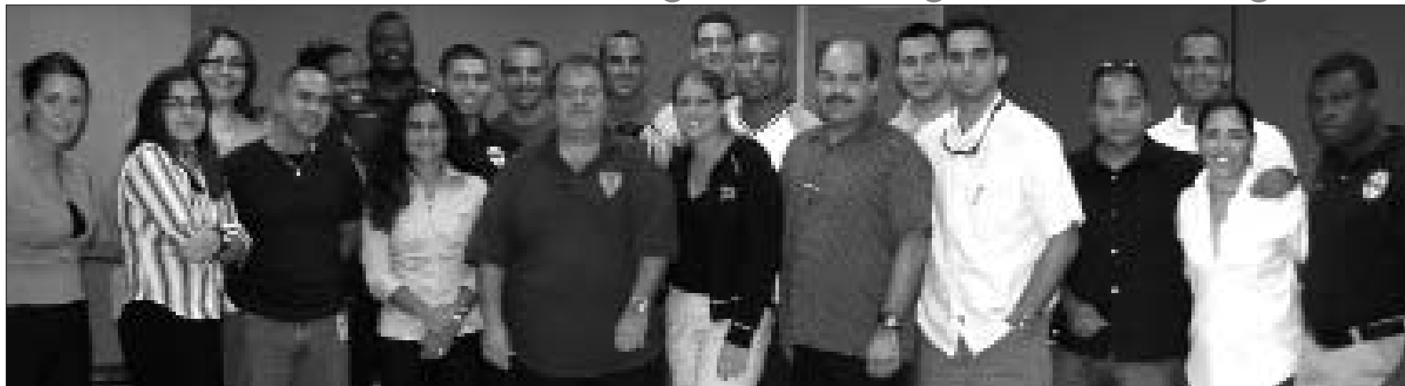
Miami-Dade police at CIT training with YES speakers.

In the last decade, reports of police departments offering sensitivity training on orientation and gender topics has increased in US media. These articles cite improved community relations and a reduction in mis-understanding between police and citizens. Cities that include Atlanta, Washington