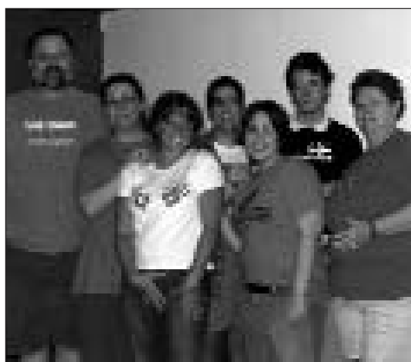
OUTstanding Amarillo participants in the Leadership in Action course.