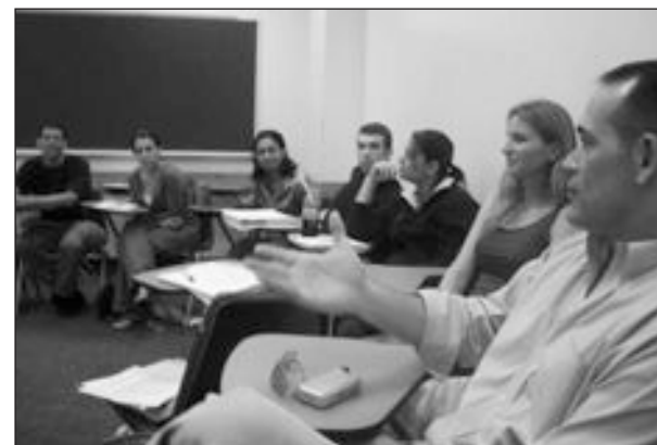
FIU graduate counseling students at YES presentation.