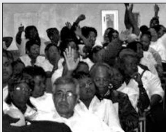
Engaged participation of bus drivers.

The audience, which was primarily African American and Latin, enjoyed religious songs and celebrations throughout the day’s presentations. A rousing gospel song about Jesus preceded the introduction of YES speakers. After learning the mission of YES, some time elapsed before brave audience members raised their hands with questions, which sometimes made them targets for ridicule from the crowd.