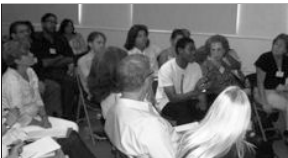
In the July communication course.

Teachers, counselors, and social workers from Miami-Dade County Public Schools (MDCPS) participated in our signature Communication Solutions™ Course in July. Other attendees included parents, students, and business and