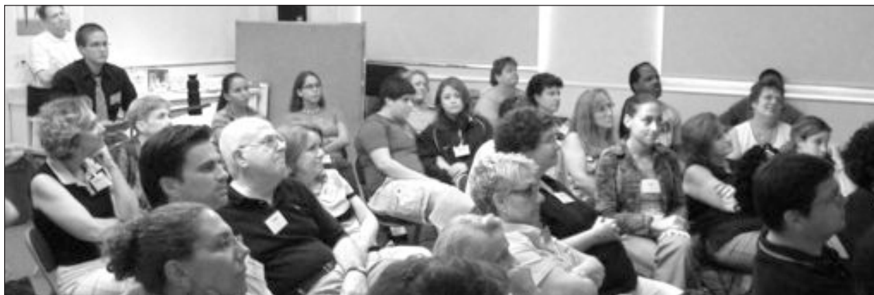
Participants in the Gender Continuum course exploring new views on gender.

People from around the country express interest in taking the work of YES into their communities, and becoming certified YES educators and speakers. We organized Summer Education Week, an intensive 4-day training program, to meet the demand of parents committed to making schools safer for their transgender children.