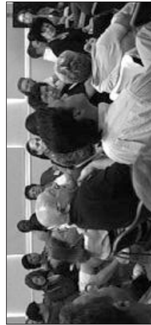
Participants in the YES Gender Continuum course.

Preview the Gender Continuum www.yesinstitute.org/video/